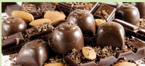
Amber Lyn Chocolates of St. George, UT

Consumers still want luxury products. Chocolates are one of the few affordable luxuries left in today's economy. So, this sweet little item has become one of the top selling gift items for florists.