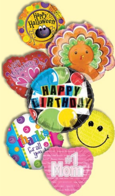
Balloon Bouquet from Bargain Balloons in Mississauga, ON

Selling balloons, stuffed animals, chocolates and more is an easy way to boost your average sale and give your customers a more personalized purchase. However, you need a game plan to ensure your continued success in making these simple and quick extra sales: